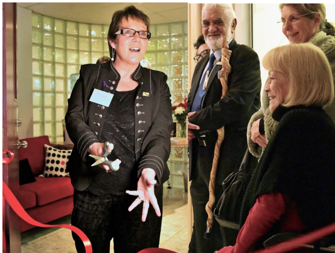
GRG's New National Support Office—Official Opening (see p2)